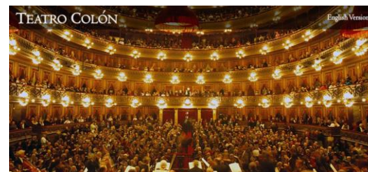
World renowned Teatro Colón, (Colón Theatre) Buenos Aires, Argentina